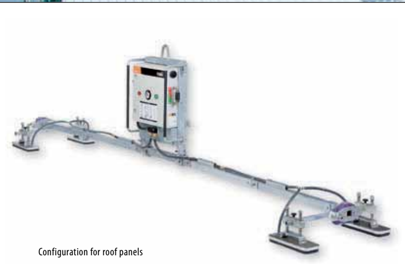
Configuration for roof panels